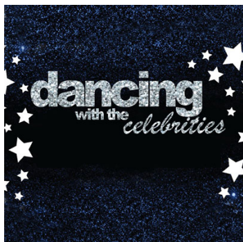
Dancing with the Celebrities Friday, May 3