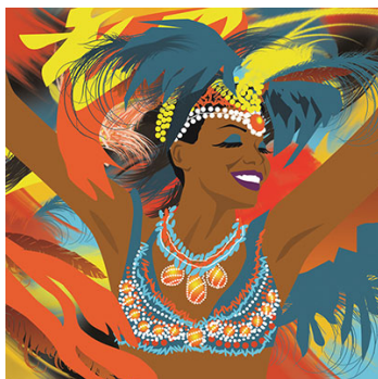
River City Brass Caribbean Carnivale Sat, May 4