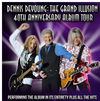
Dennis DeYoung Fri, Oct 19