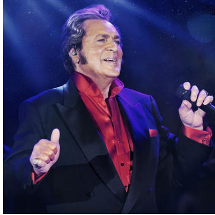
Engelbert Humperdinck Sun, Oct 28

Click here for a complete Palace Schedule of Events